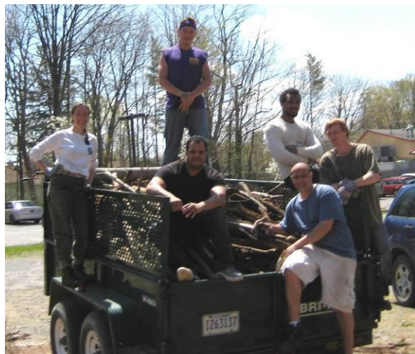
Daytop volunteers helped with cleanup of the Winnakee Preserve entrance

Phase one required the removal of years of accumulated storm debris from the area around the trailhead. It took volunteers from Daytop Village – with assistance from the Hyde Park Recreation Department and National Park Service – two days to clear nearly 20 tons of woody debris. The Town of Hyde Park Highway Department has generously donated fill material to grade the cleared area.