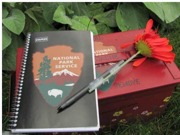
Every geocache contains a logbook to sign.

So far, so good. The eleven geocaches at the Roosevelt-Vanderbilt NHS went live at the end of May, and by the first week of August, people had logged over 300 finds. People come from all over, and the feedback is good. What is not to like? In addition to the usual challenges (and trinkets) of geocaching, and being guided to interesting places -- (Please stay on the trails! Remember that part about protecting our resources!) -- each cache includes some interesting information that you might not find out during your standard tour or the National Parks. And it's all right there, right along the trail.