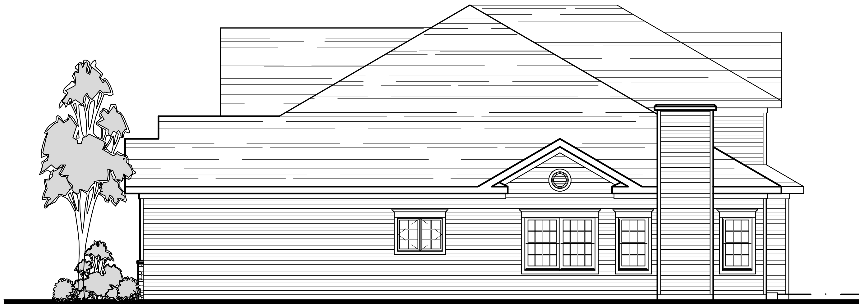
2 PROPOSED RIGHT SIDE ELEVATION SCALE: 3/16" = 1'-0" (LEFT SIDE SIMILAR) 0 1' 2' 5' 10'