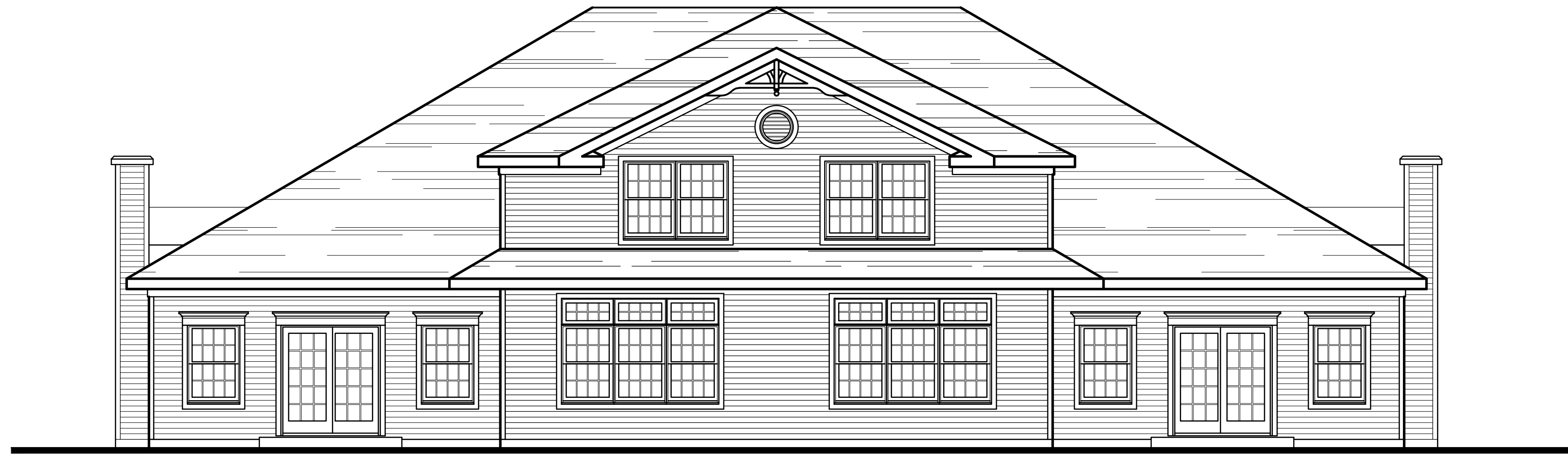
3 PROPOSED REAR SIDE ELEVATION SCALE: 3/16" = 1'-0" 0 1' 2' 5' 10'

PROPOSED TWO FAMILY UNITS FOR: THE ENCLAVE AT HYDE PARK HYDE PARK, NY CREAM STREET