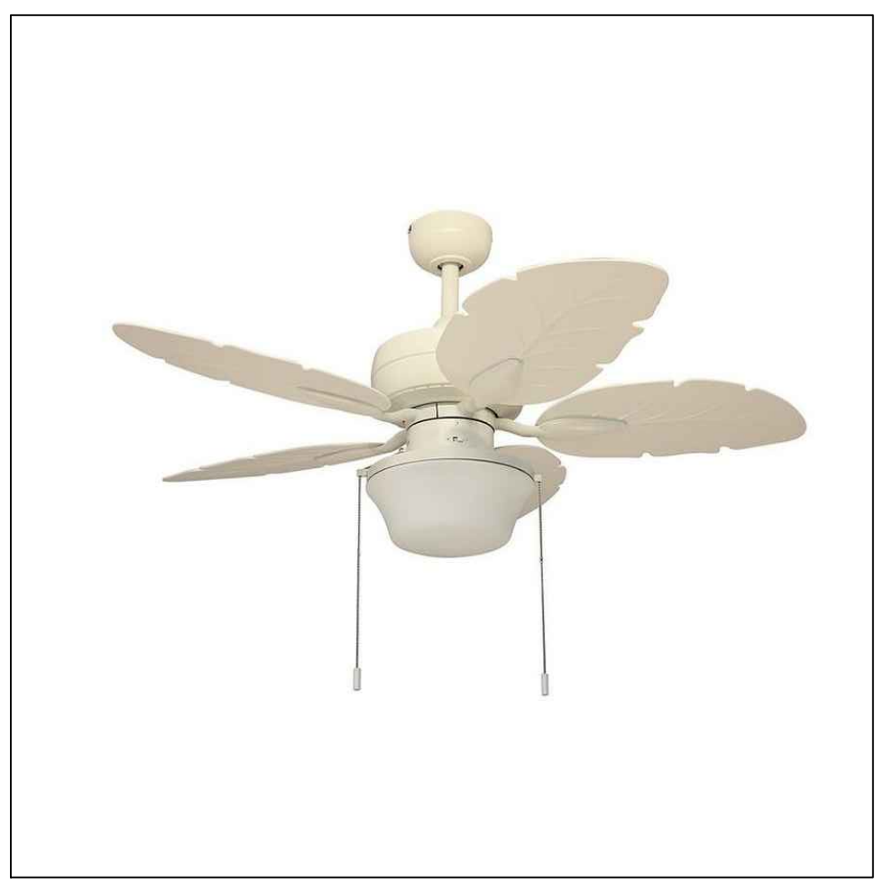
EXTERIOR CEILING FAN EXAMPLE N.T.S.