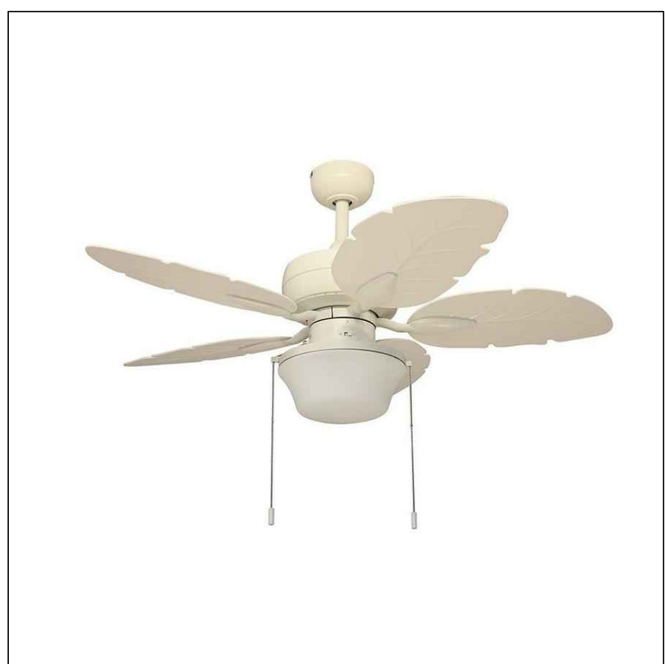
EXTERIOR CEILING FAN EXAMPLE N.T.S.