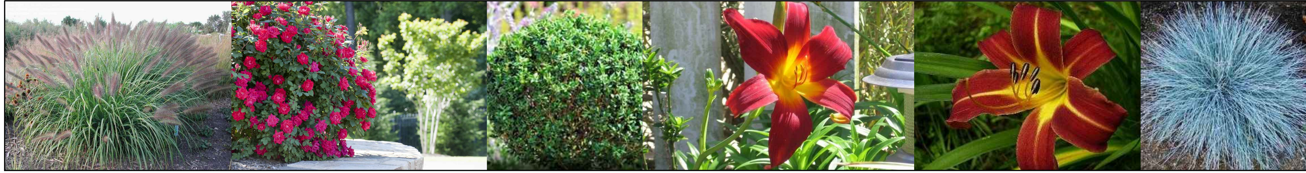
Rh - Red Headed Fountain Grass Ko - Pink Double Knock Out Rose Cb - Common Boxwood DI - Ming Toy Daylily DI - Red Autumn Daylily BF - Elijah Blue